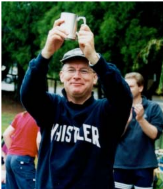
Victory is sweet

Several public events were organised: some worked, some did not. 53 These included a men's walk, annual golf days, women's coffee meetings, cricket matches against North Terrace, and annual celebrations of the anniversary of their beginning, the first a happy family day in the nearby Mount Lofty Botanic Gardens. Schools work was begun, using the Scripture Union Options Program and the like. A set of the well-practised 'Why' series of evangelistic meal and talk meetings was conducted. 54 The available program of activities in place at North Terrace was publicised and, for example, a number of Hills men attended the 2001 Katoomba Men's Convention. Monday morning meetings of a few key leaders canvassed the (non) attendance of the previous day and allotted follow-up action. When the Edwards moved into their (rented) house they celebrated by hosting a series of after-church Sunday barbecues, to which 40-50 people came.